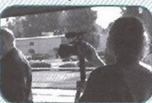
A film crew shoots footage for a 9/11 cross & metal book documentary