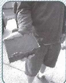
A piece of steel from the trade center rubble