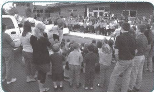
Local school children get to see the cross up close and personal and hear the story from the artist