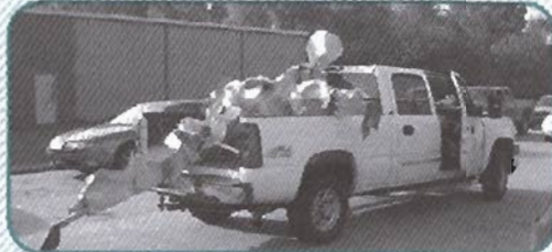
The 9/11 memorial cross is being transported from California to New York by the artist