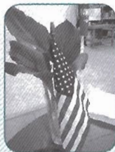
We will never forget