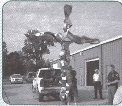
The 9/11 memorial cross is 12 ft tall and 9 feet wide