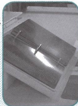
The stainless steel 9/11 book with all the names of the victims